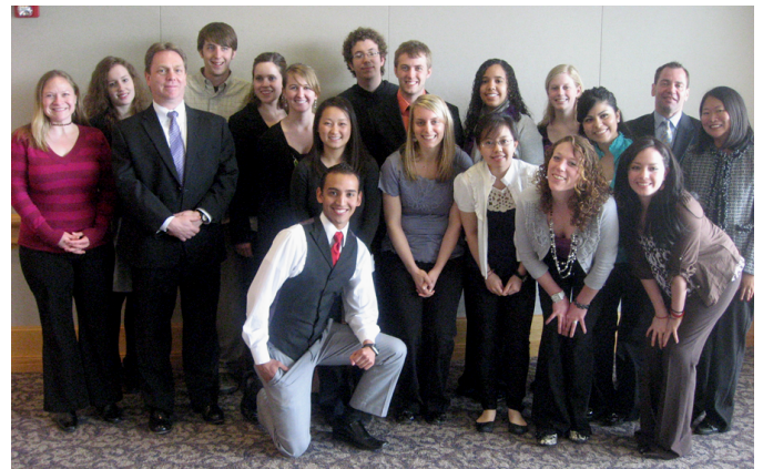
The 2011 Phillips Scholars and Staff

We plan to bring our grantees together with other stakeholders more frequently to develop strategy and learn from one another.